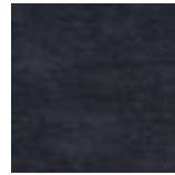
HA3 Squalo blu