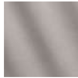
HAF Volpe artica